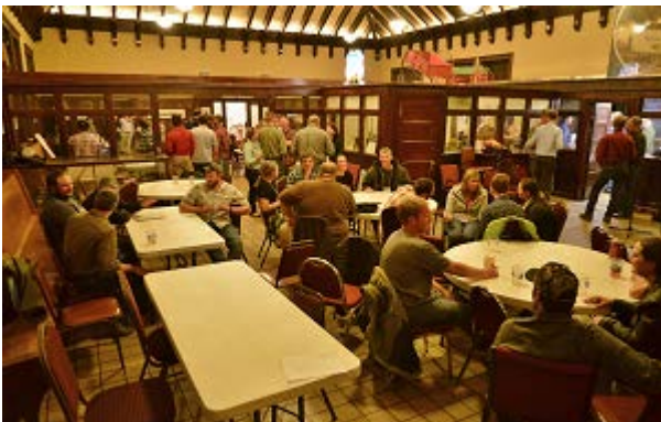
Students and Mentors mingle at the 2016 Student Social.

"Thus far, my mentorship has been a great learning experience and a ton of fun!"