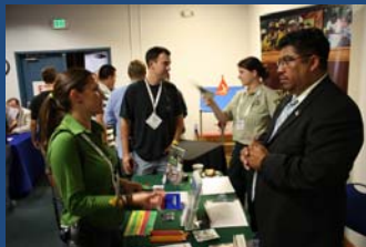
2011 Annual Meeting student-employer career fair

"The mission of the American Fisheries Society is to advance sound science, promote professional development, and disseminate science-based fisheries information for the global protection, conservation, and sustainability of fishery resources and aquatic ecosystems."