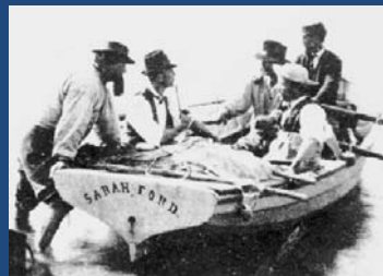
Fisheries researchers launching skiff 1870's

The American Fisheries Society (AFS) is the world's oldest and largest organization dedicated to strengthening the fisheries profession, advancing fisheries science, and conserving fisheries resources